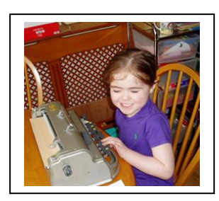
KEEP "B.E.L.L" RINGING IN 2014

"The Braille Enrichment for Literacy and Learning Program, or BELL is a two week summer day camp for children ages 4 through 12. BELL provides intensive immersion into Braille, Daily Living Skills and Orientation and Mobility. Most importantly it provides children the opportunity to gain self confidence, have fun and grow in the realization that being blind doesn't have to stop us from reaching our dreams."